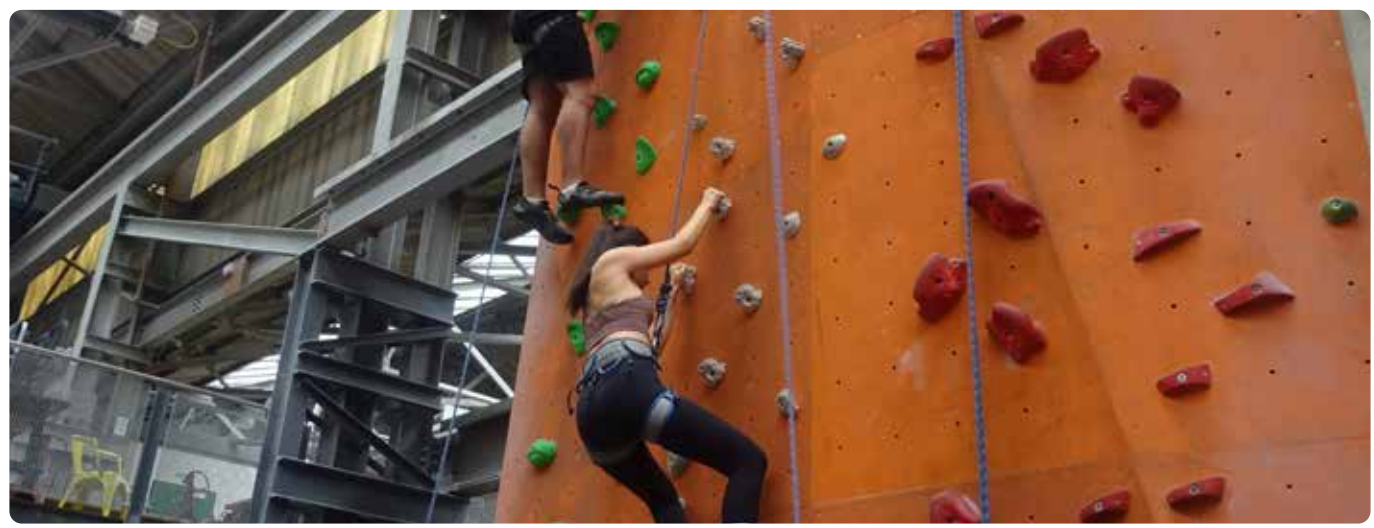
Pictures included are to illustrate the types of activities students will take part in only.

All other equipment, including safety equipment, will be provided by the activity venue. It is not necessary for students to be able to swim as life vests are provided, but students should be comfortable in and around water. Parents/ Guardians will need to complete the 'Adventure Sports Consent Form' to allow the student to take part in this course – this form will be provided by the Admissions Team.